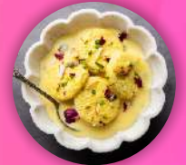
Kesar Badam Flavour